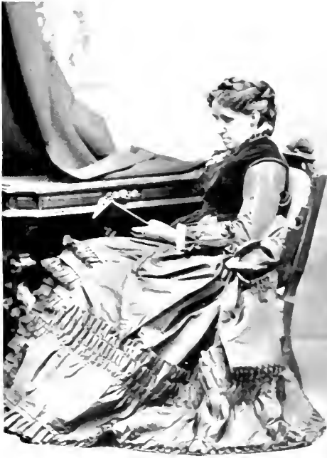
LOUISA MAY ALCOTT.

tions chiefly from Henry Thoreau. Emerson was Mr. Alcott's most intimate friend, and very early in her life Miss Alcott became his favorite. When she was fifteen Mr. Emerson loaned her a copy of "Wilhelm Meister," from the reading of which dated her life-long devotion to Goethe. At the age of sixteen Miss Alcott began to teach a little school of twenty members, and continued to do work of this kind in various ways for fifteen years, although it was extremely distasteful to her, and at the same time she began to write stories for publication. Her first published book was "Flower Fables" Boston, 1855. It was not successful. She continued to write for her own amusement in her spare hours, but devoted herself to helping her father and mother by teaching school, serving as nursery governess, and even at times sewing for a living. Many of the troubles of those early years have been referred to in the sorrows of Christie in her volume called "Work," published after her